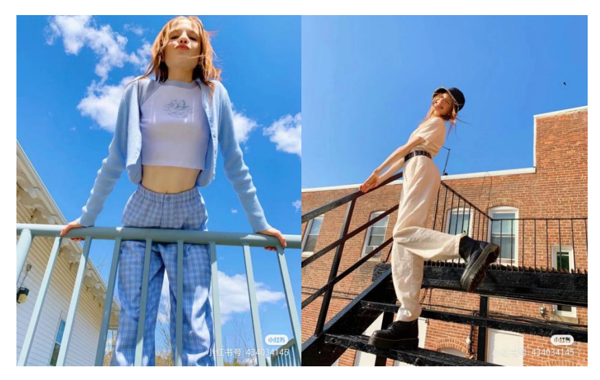
Fig 3. Sample of avoiding sexual innuendo through shooting angles

Secondly, when there is strong interaction between the character and the camera, the photographer elevates the power status of the picture character by using the elevated perspective in the language of the camera, which to a certain extent reduces the possibility of sexual innuendo brought about by the subordinate behavior (the beak in Figure 2 below) and the female line display (the waist and hip line display in Figure 2 below). The difference in status brought about by the elevation len demonstrates the terms of "sexual agency" and "sexual empowerment" which were highlighted to characterize this shift in sexualized advertisements from objectified to subjectified women (Gill, 2008), and seems to reflect the Zeitgeist of women becoming independent- this includes agency in their sexuality. According to this view, being sexy and agentic at the same time can be seen as liberating for women, not the follower of men's desire (Dahl et al., 2009).