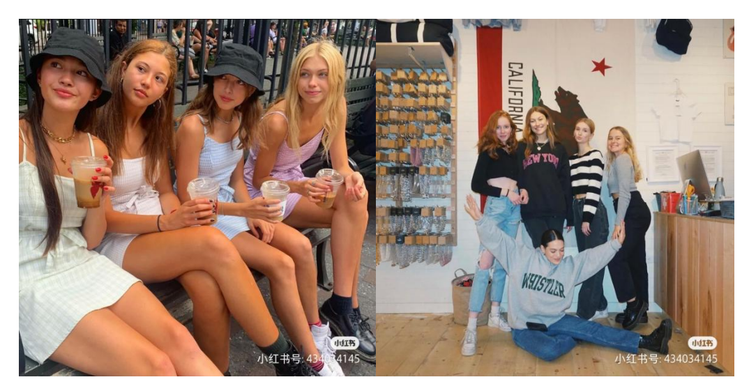
Fig 4. Sample of avoiding sexual innuendo through group power

Compared to the early 20th century's straightforward display of female lines, the display of female lines now tends to be achieved through street-style photography. In the above picture, for example, the model highlights her body curves and reflects her personality through her autonomous daily movements, instead of showing her female curves through revealing clothes and impersonal sexy movements, thus avoiding the suspicion of objectifying women by BM brand.