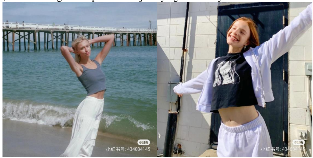
Fig 5. Obscure female line display

Compared to the early 20th century's straightforward display of female lines, the display of female lines now tends to be achieved through street-style photography. In the above picture, for example, the model highlights her body curves and reflects her personality through her autonomous daily movements, instead of showing her female curves through revealing clothes and impersonal sexy movements, thus avoiding the suspicion of objectifying women by BM brand.