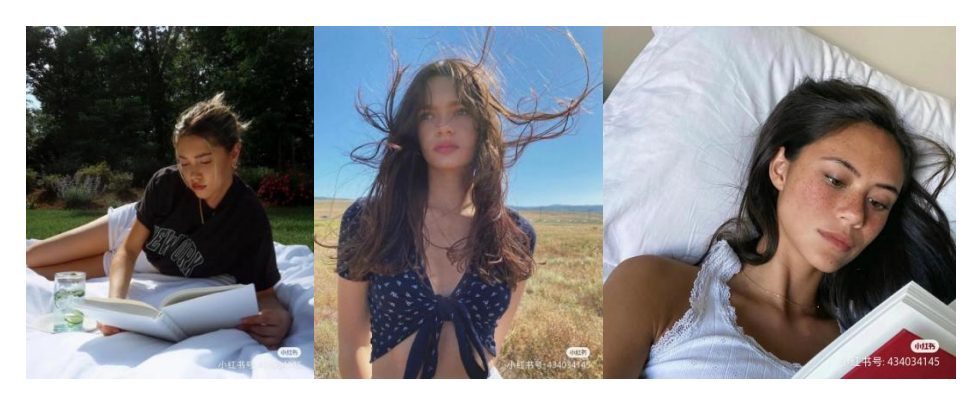
Fig 2. A sample of avoiding sexual innuendo by increasing emotional distance

Secondly, when there is strong interaction between the character and the camera, the photographer elevates the power status of the picture character by using the elevated perspective in the language of the camera, which to a certain extent reduces the possibility of sexual innuendo brought about by the subordinate behavior (the beak in Figure 2 below) and the female line display (the waist and hip line display in Figure 2 below). The difference in status brought about by the elevation len demonstrates the terms of "sexual agency" and "sexual empowerment" which were highlighted to characterize this shift in sexualized advertisements from objectified to subjectified women (Gill, 2008), and seems to reflect the Zeitgeist of women becoming independent- this includes agency in their sexuality. According to this view, being sexy and agentic at the same time can be seen as liberating for women, not the follower of men's desire (Dahl et al., 2009).